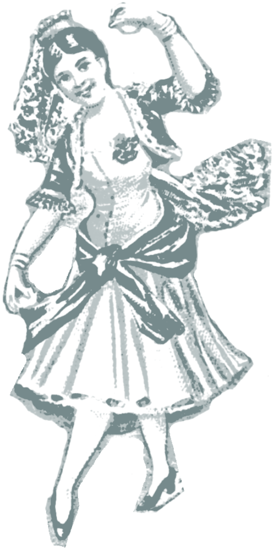
Processed by Matsumoto Naoki Original: Fandango, from National Dances (N225, Type 1) issued by Kinsey Bros. 1889 https://commons.wikimedia.org/wiki/File:Fandango_from_National_Dances_(N225_Type_1)_issued_by_Kinsey_Bros._MET_DP8874478.jpg