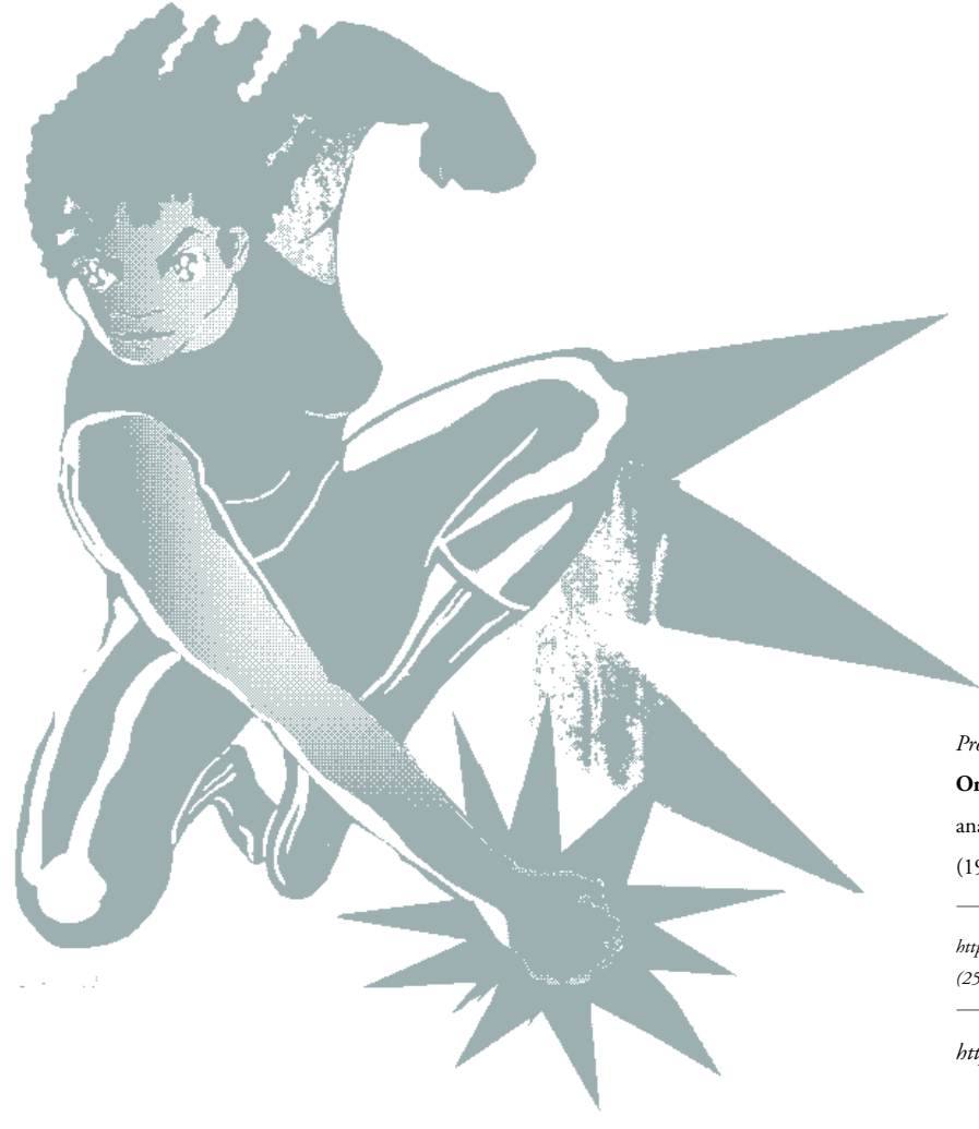
Original: Mars 2016, Couverture d'Alternative libertaire, mensuel anarcho-communiste français, organe de presse d'Alternative libertaire (1991-2019) puis de l'Union communiste libertaire (à partir de 2019). https://commons.wikimedia.org/wiki/File:Alternative_libertaire_mars2016_(25274259416).jpg https://www.unioncommunistelibertaire.org