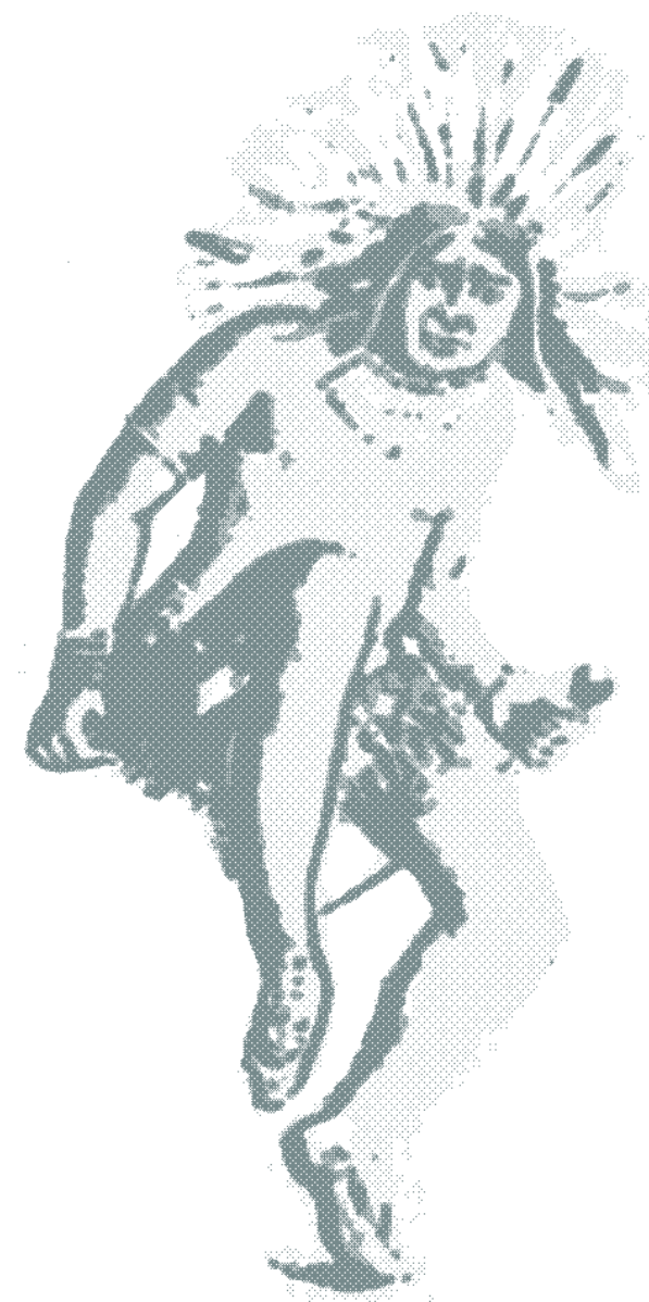
Processed by Matsumoto Naoki Original: War Dance, from National Dances (N225, Type 1) issued by Kinsey Bros 1889 https://commons.wikimedia.org/wiki/File:War_Dance_from_National_Dances_(N225_Type_1)_issued_by_Kinsey_Bros._MET_DP8874557.jpg