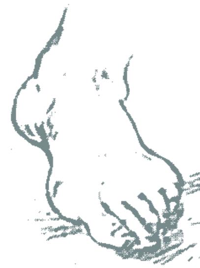
Processed by Matsumoto Naoki Original: Plate 7: Five feet, from "The Book for Learning to Draw" (Livre pour apprendre à dessiner) circa 1649 https://commons.wikimedia.org/wiki/File:Plate_7_-_Five_feet_from_%27The_Book_for_Learning_to_Draw%27_(Livre_pour_apprendre_%27à_dessiner)_MET_DP831136.jpg