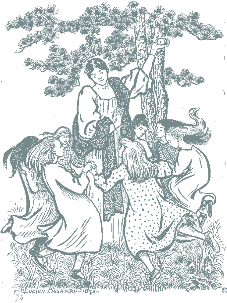
Original: Children's Dance (Ronde d'enfants) Creator: Lucien-Camille Pissarro. 1894 https://commons.wikimedia.org/wiki/File:Children%27_Dance_(Ronde_d%27enfants)_MET_DP838469.jpg